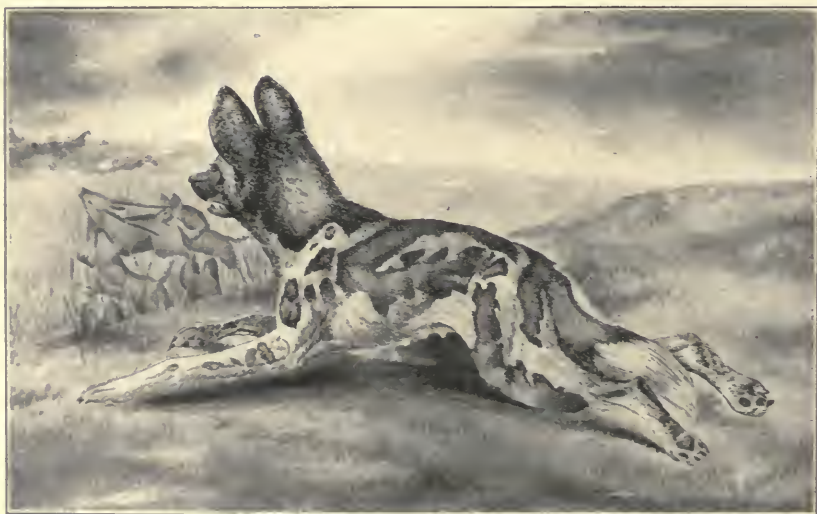
FIG. XLV. LYCAON PICTUS. HYÆNA DOG.

1. Juv. — P. South Africa. Ward's Nat. Scien. Establ., Rochester, N. Y.